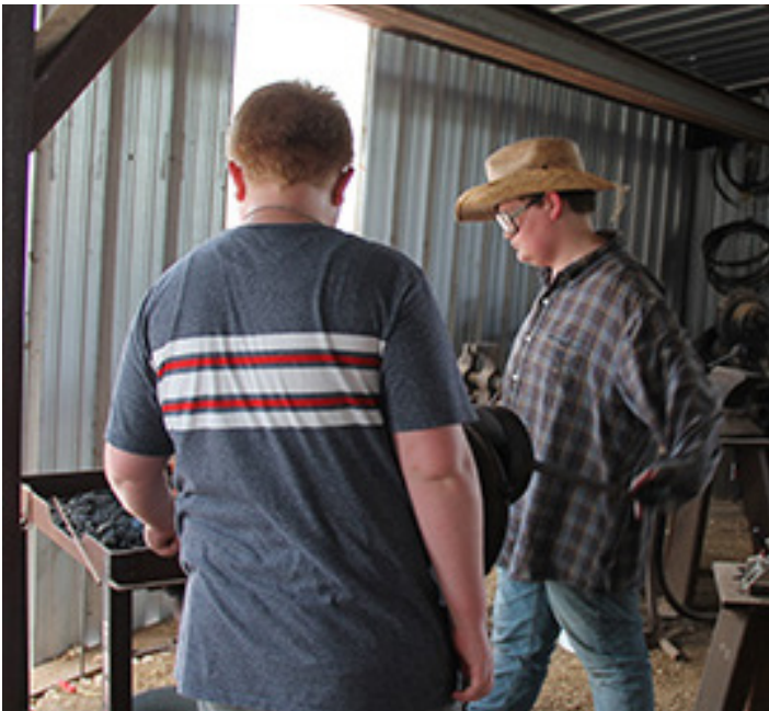
Two youngsters get some time at the forge