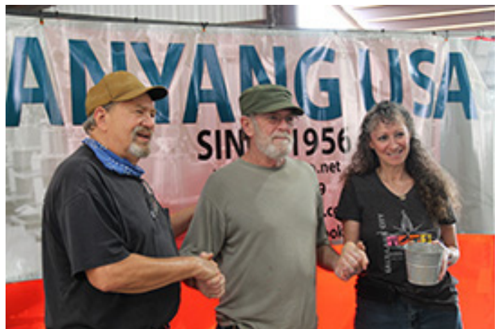
You can win doorprizes (sometimes)