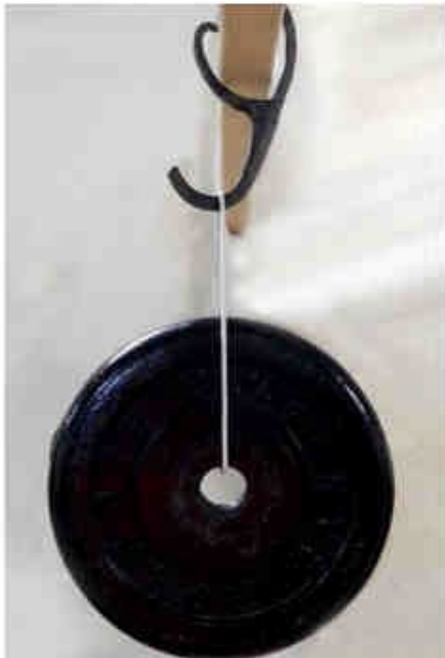
Should hold 100 pounds easily on a good 2 x 4-6-8.

Draw out approximately 3 inches. Then taper the end.