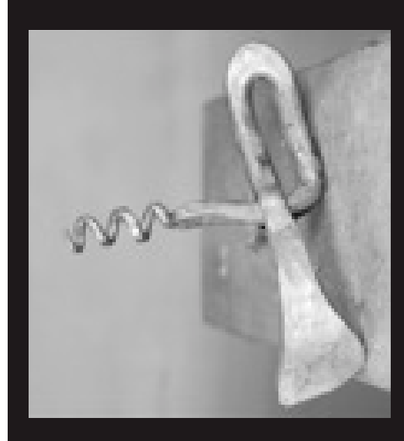
ONE PIECE CORKSCREW FROM ALLOY STEEL