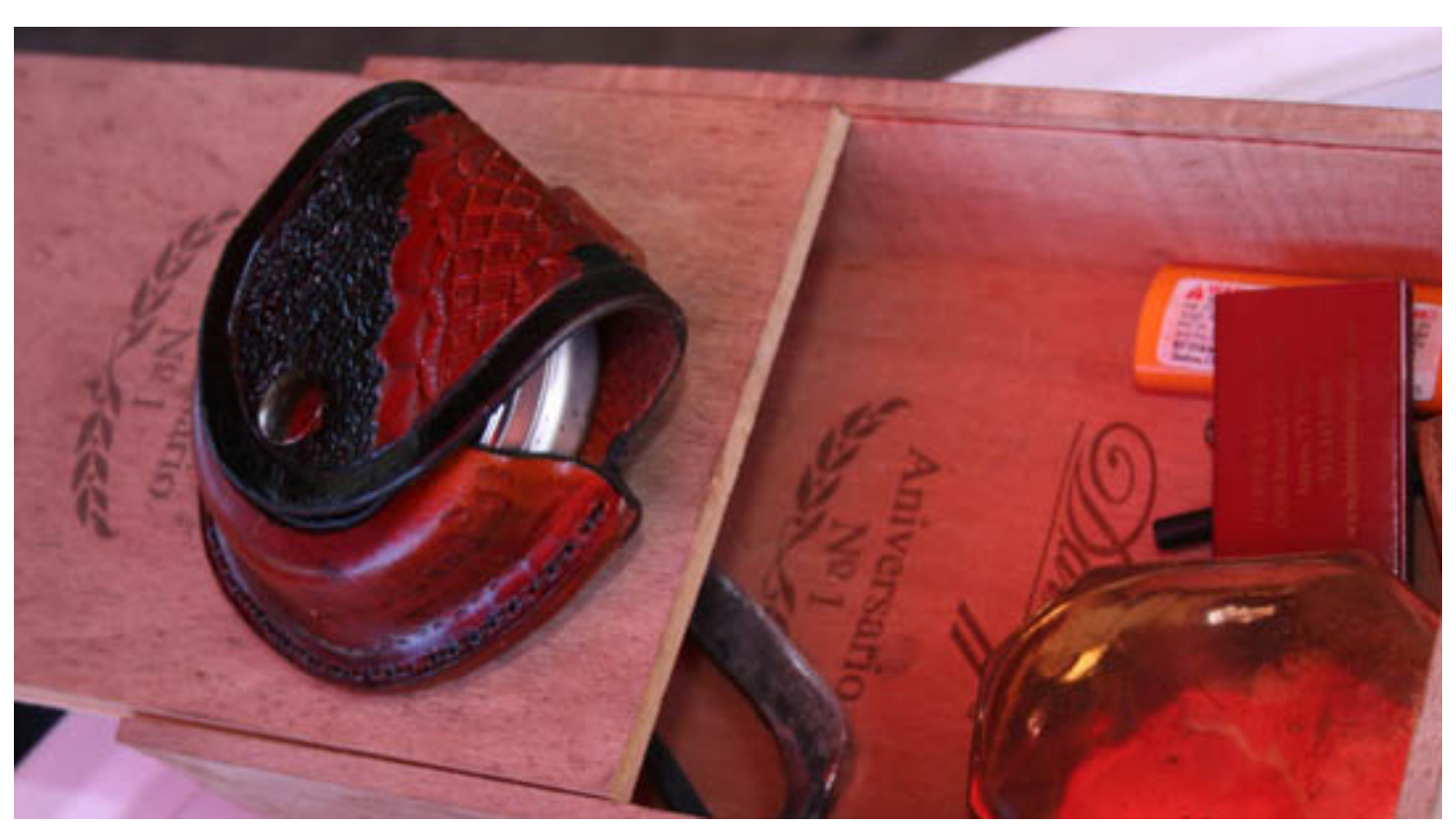
W W W . B A L C O N E S F O R G E . ORG