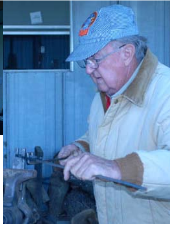
Well made tools last a long time.