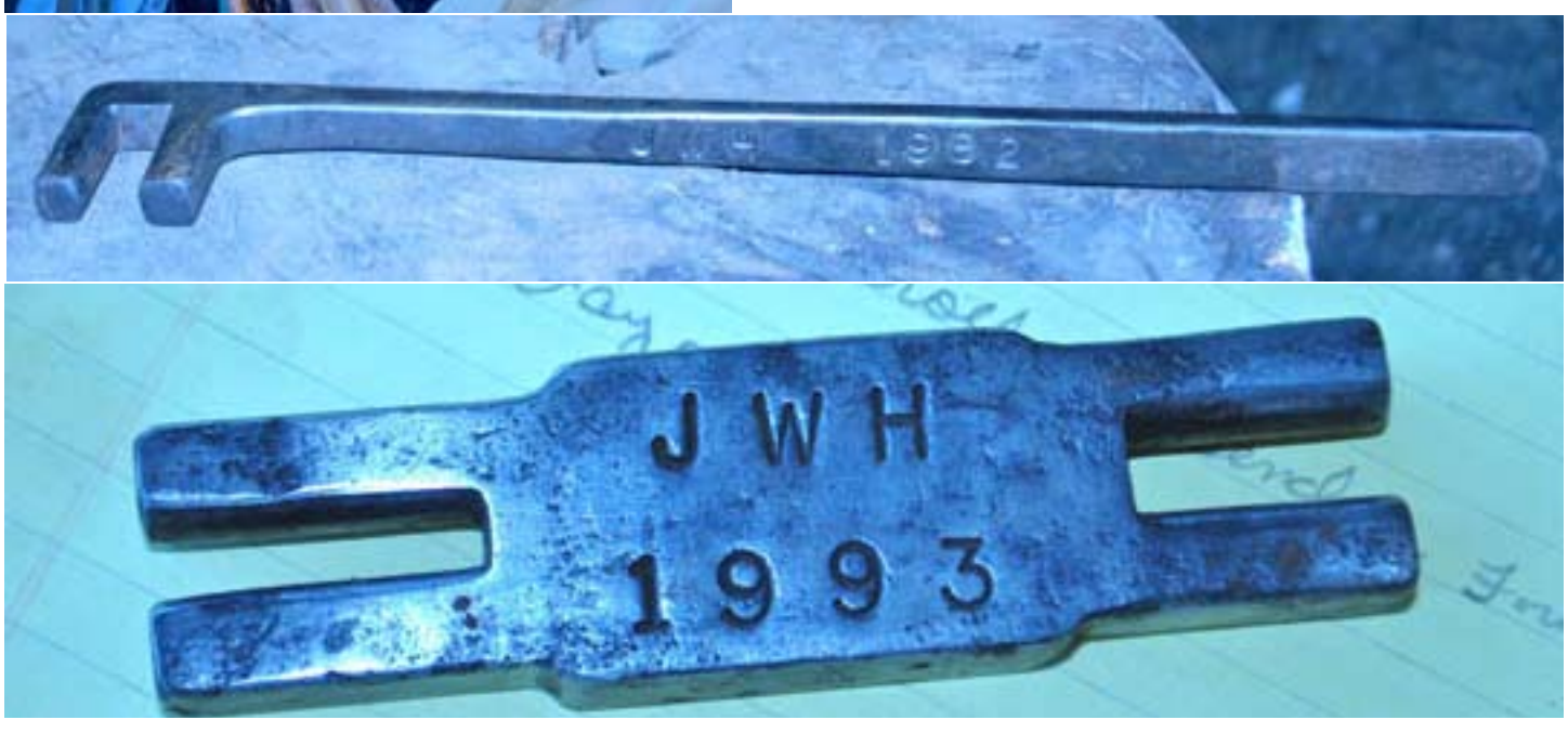
W W W . B A L C O N E S F O R G E . ORG