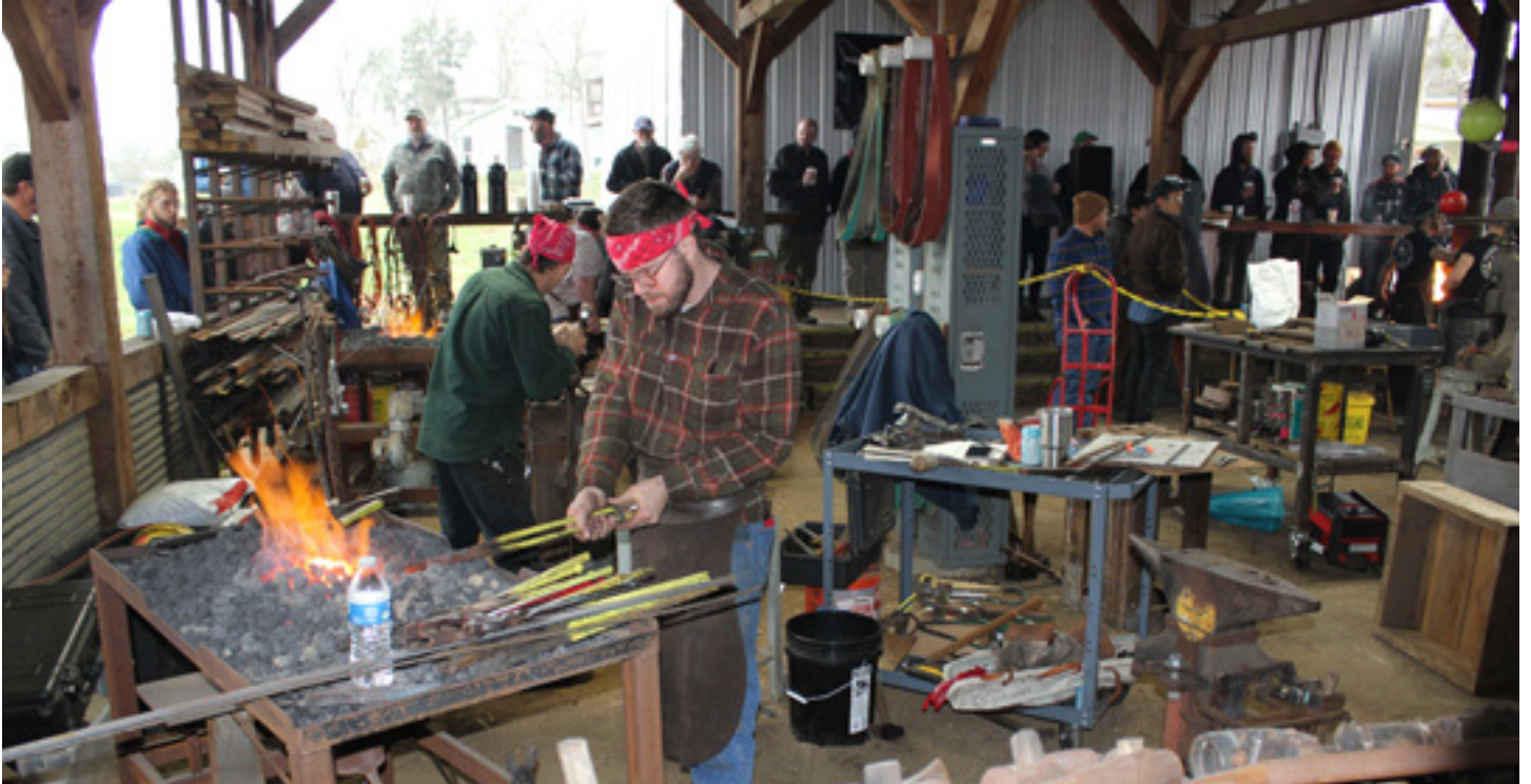
Photos from Austin Forging Competition