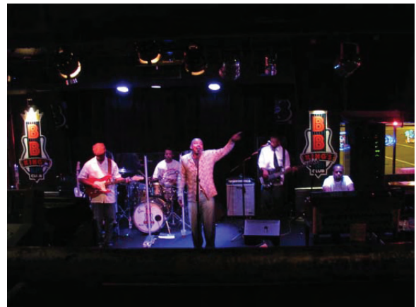
It wasn't all work!