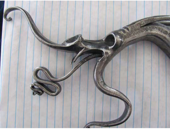
The famous Dan Boone dragon