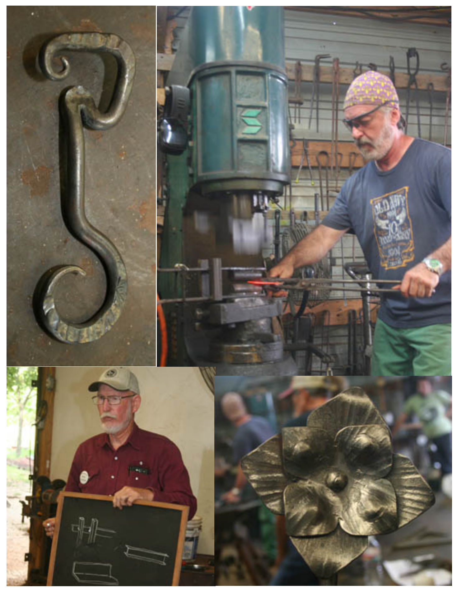
W W W . B A L C O N E S F O R G E . ORG