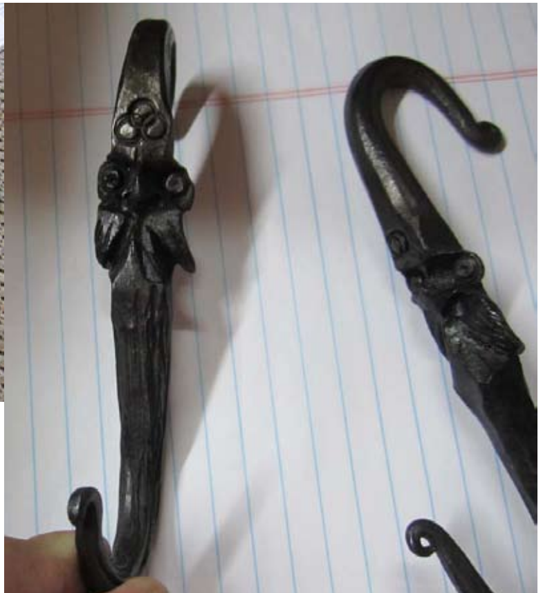
Scenes from the June Meeting