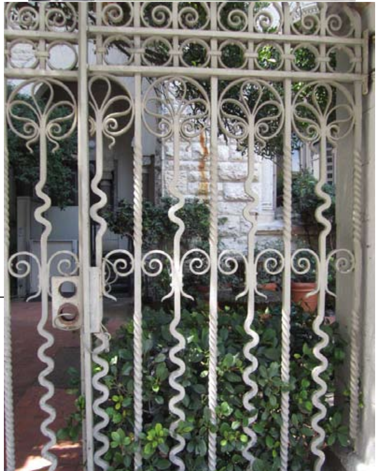
Cool iron work in downtown San Antonio