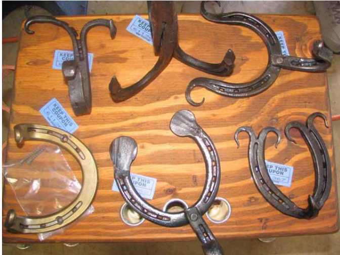
Trade Items from the June Meeting.

Remember the auctions at our demos are what really pays the costs of this organization. Our dues alone would barely cover the cost of the newsletter so it is YOUR generous donations to the auction that keep the organization going strong.