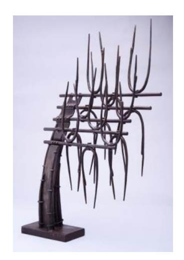
March 30, 2019