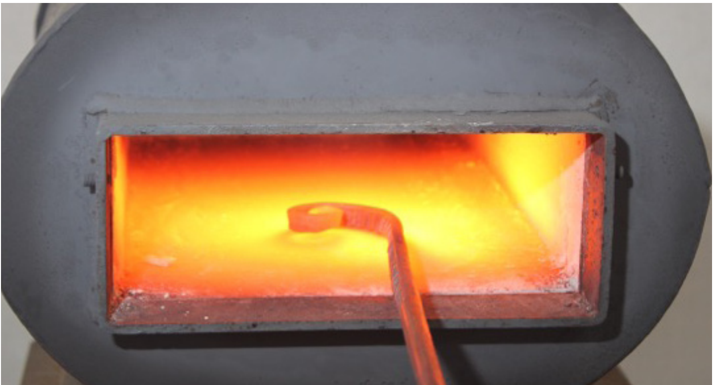
A Fiddle Head Fern in the making