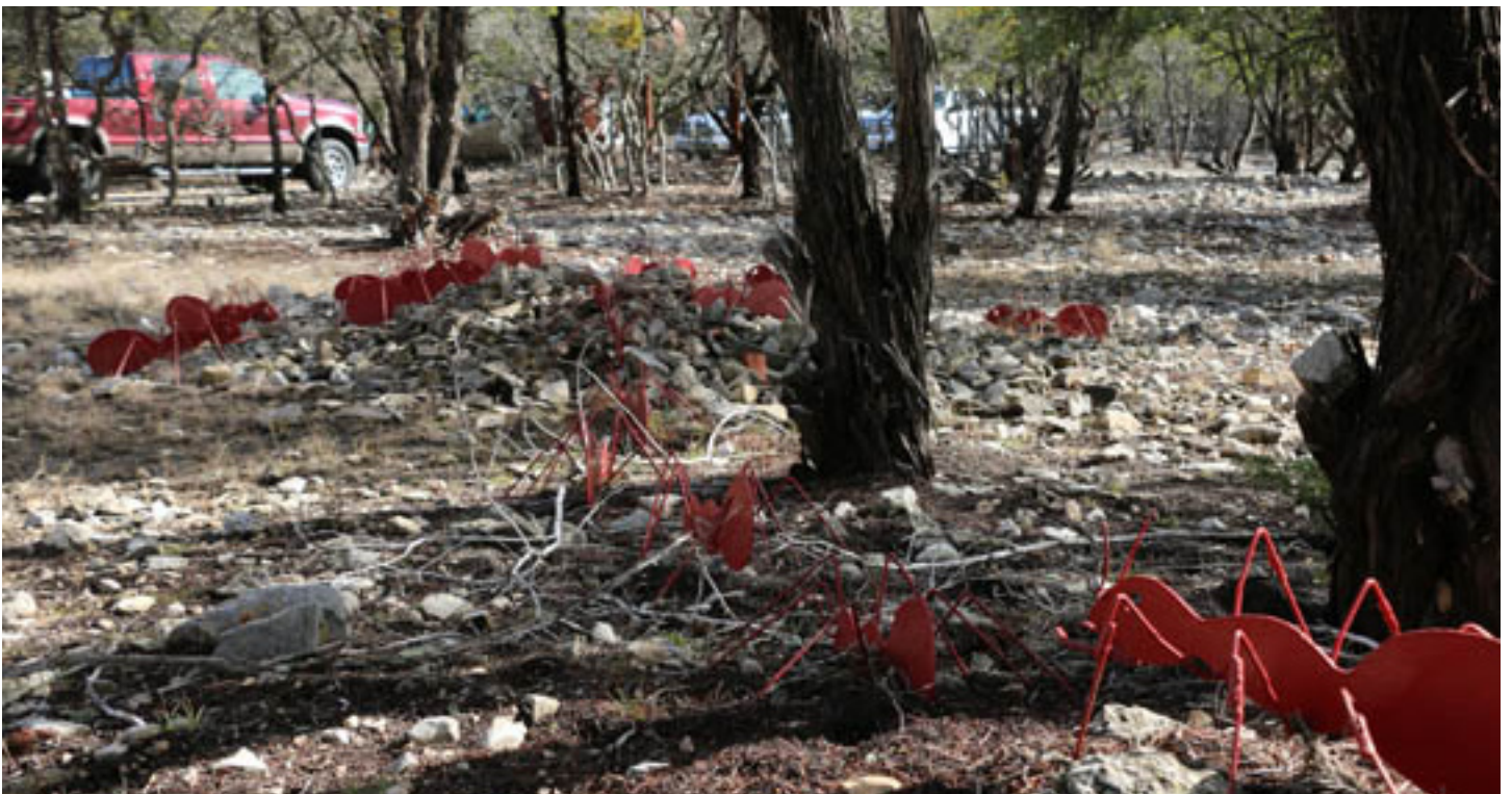
The fire ants are HUGE down around Hunt, Texas WWW.BALCONESFORGE.ORG