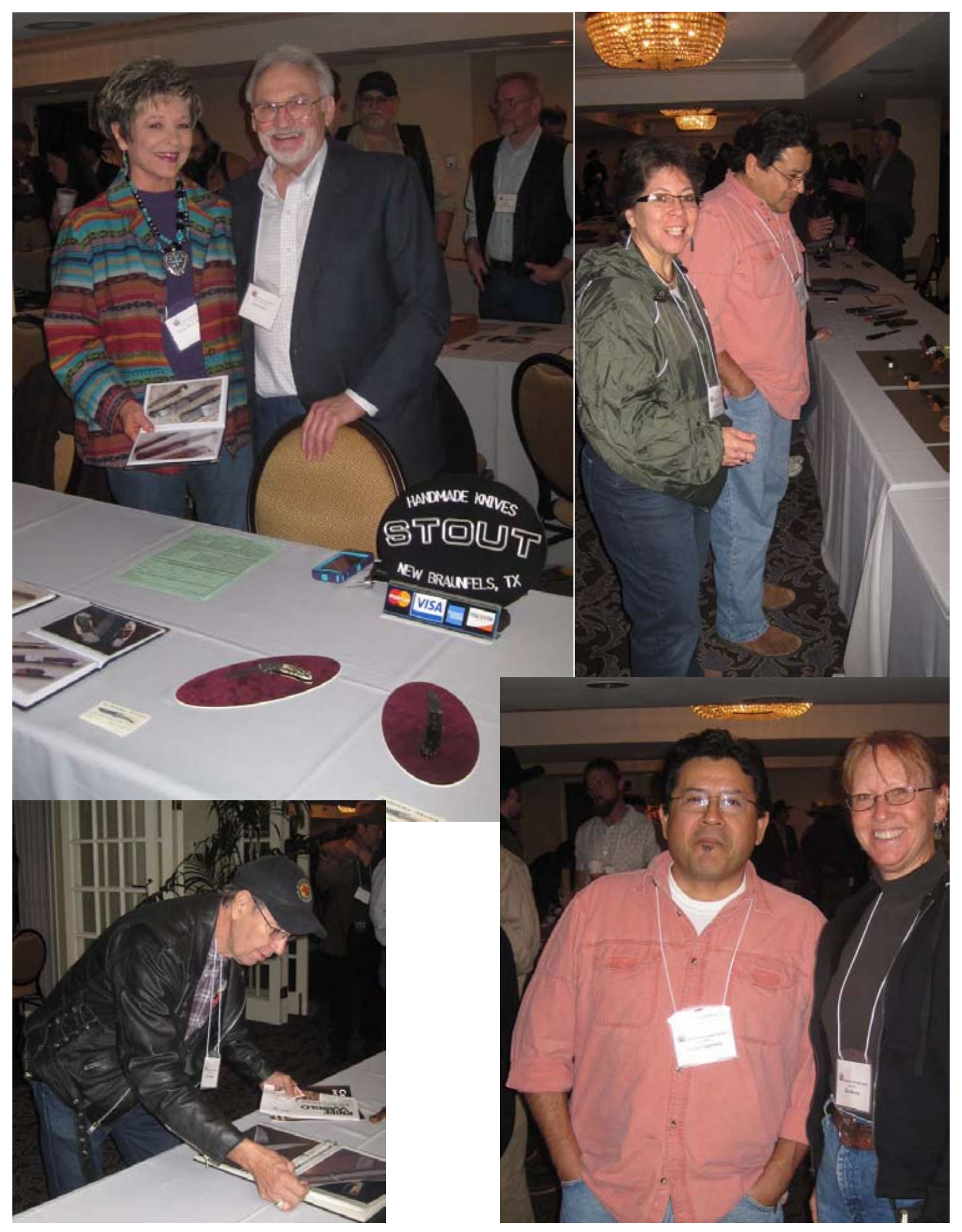
W W W . B A L C O N E S F O R G E . ORG