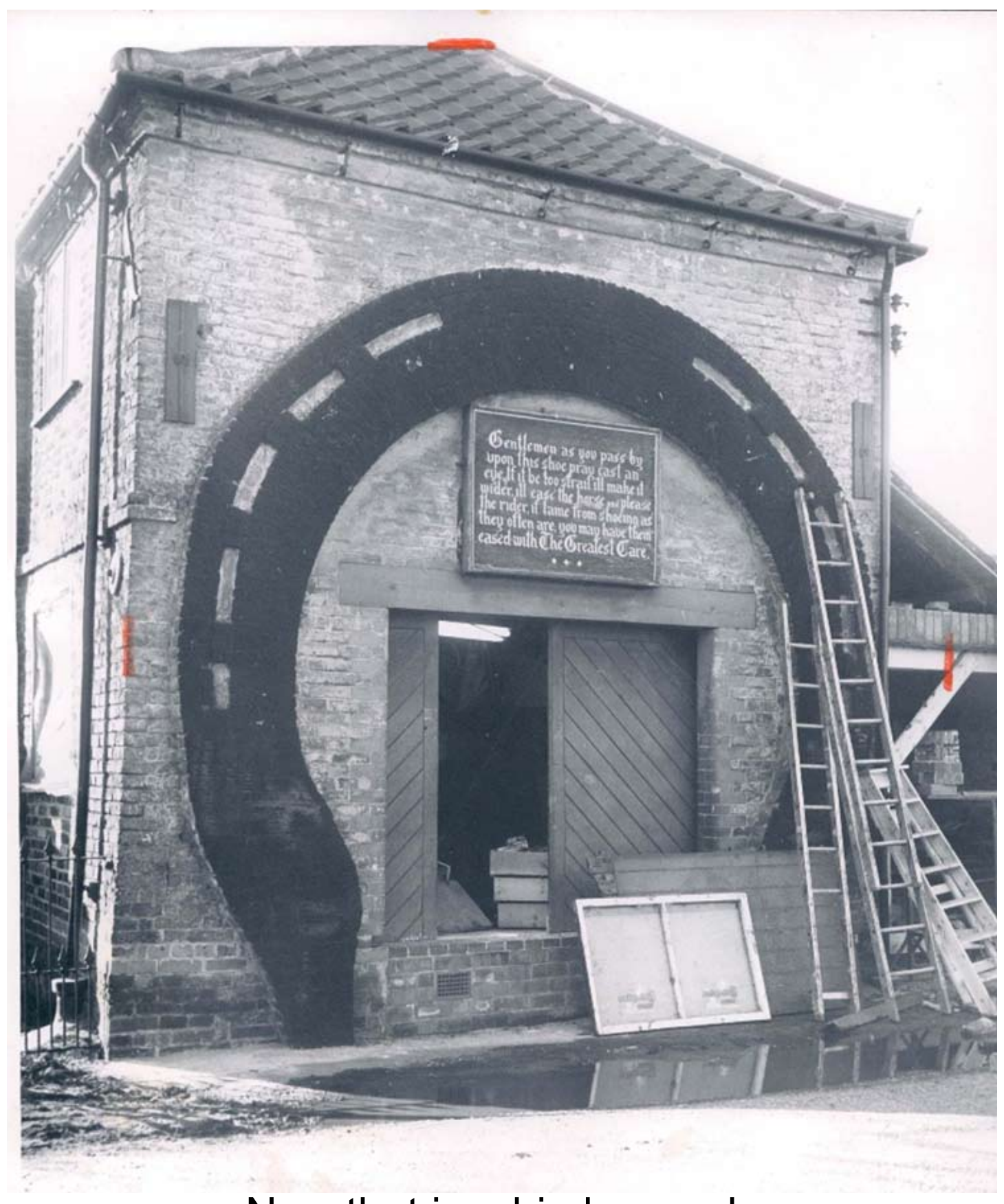
Now that is a big horse shoe