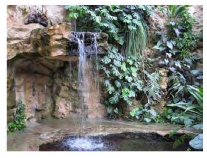
It doesn't have to have metal to be pretty.

Scenes from the January meeting.