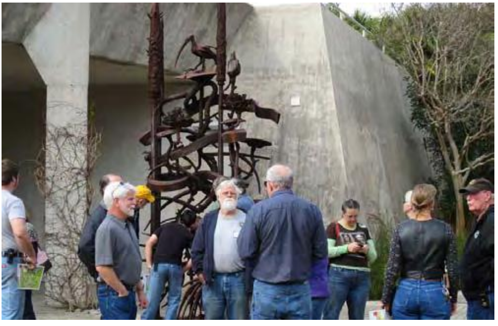
No doubt one of these smiths was saying "I could do that!"

Scenes from the January meeting.