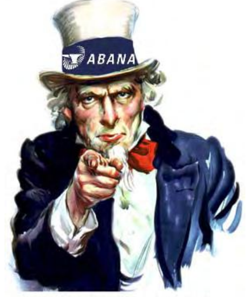
We Need You Now!