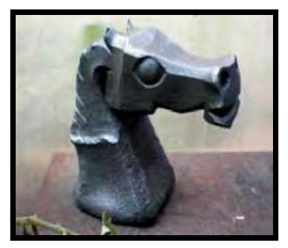
April 2-3, 2011