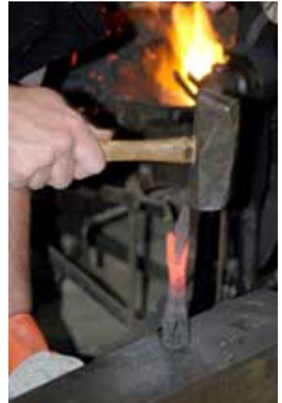
Scenes from the January 08 Meeting