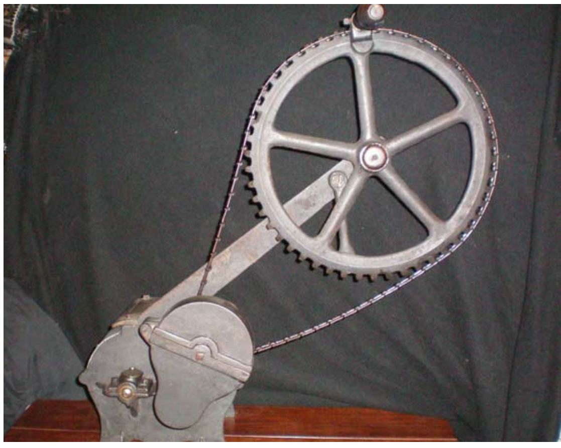
W W W . B A L C O N E S F O R G E . ORG