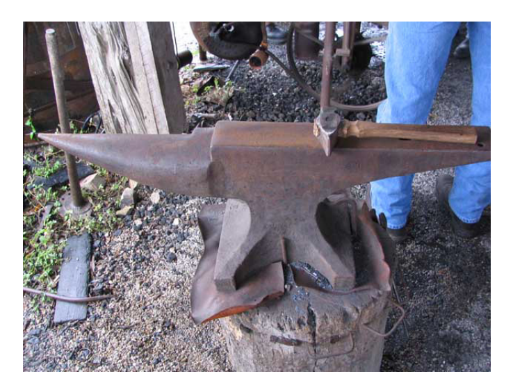
W W W . B A L C O N E S F O R G E . ORG