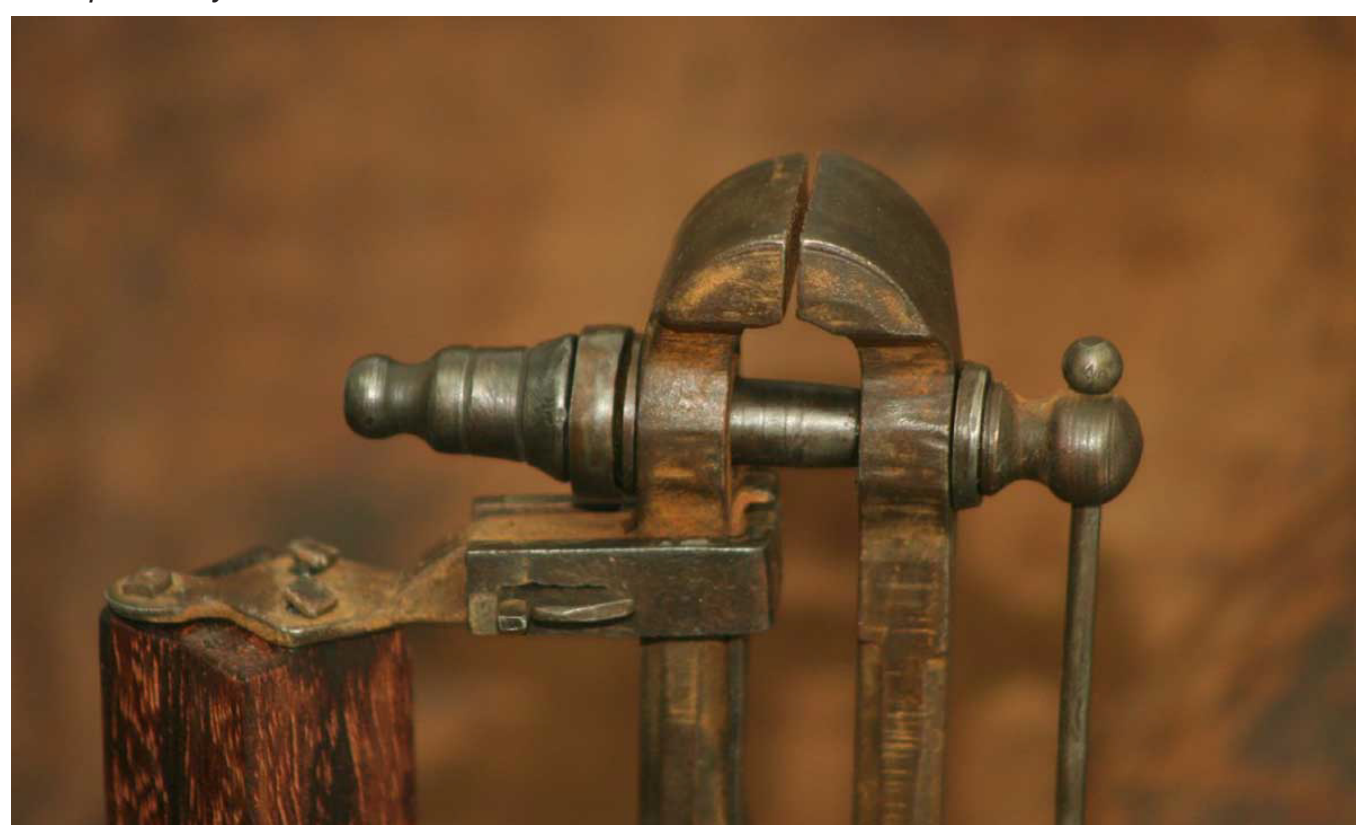
W W W . B A L C O N E S F O R G E . ORG