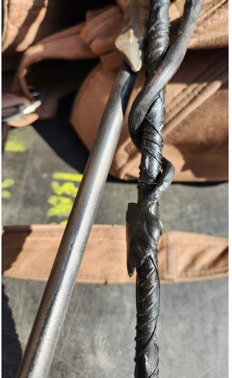
Trade Items from the August Meeting