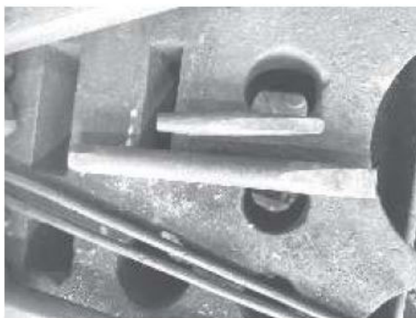
Below: Face and side views of the slot punch and 5/8 slot drift.