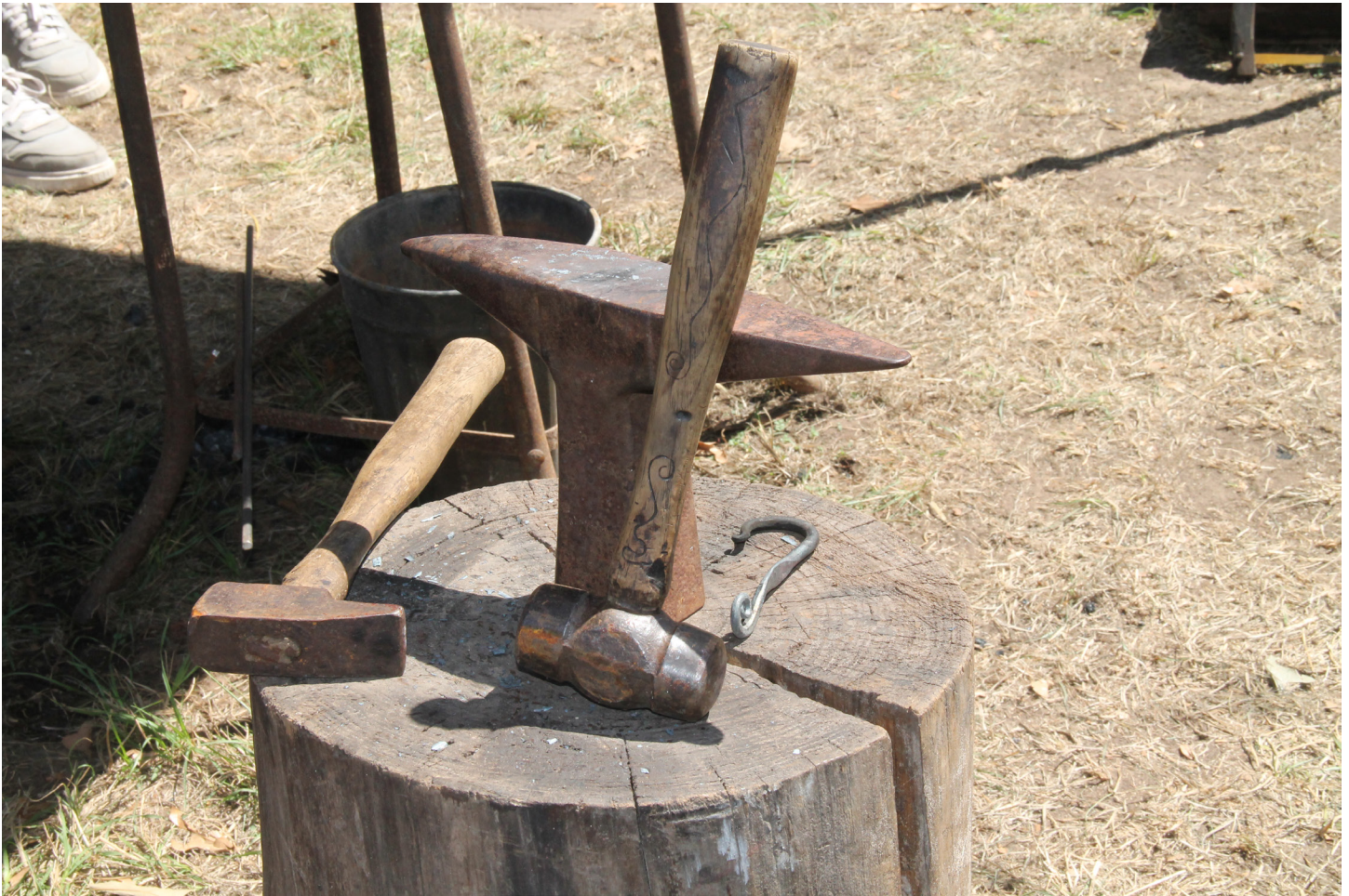
Scenes from the September meeting.