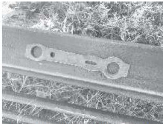
Above: Round-punched and drifted hole on the left, slot-punched and drifted hole on the right.

The slot-punched hole is merely opened up with minimal stretching to achieve the \frac{3}{4} inch final hole size. It has an even mass around the perimeter of the hole, substantially more mass than the round-punched hole. That is the strongest way of putting a \frac{3}{4} inch hole in a \frac{3}{4} inch wide bar. The series of tools for the slot-punched hole was a slot punch \frac{3}{4} to \frac{13}{16} wide, then a \frac{5}{8} slot drift to open the hole, then a \frac{3}{4} final size drift.