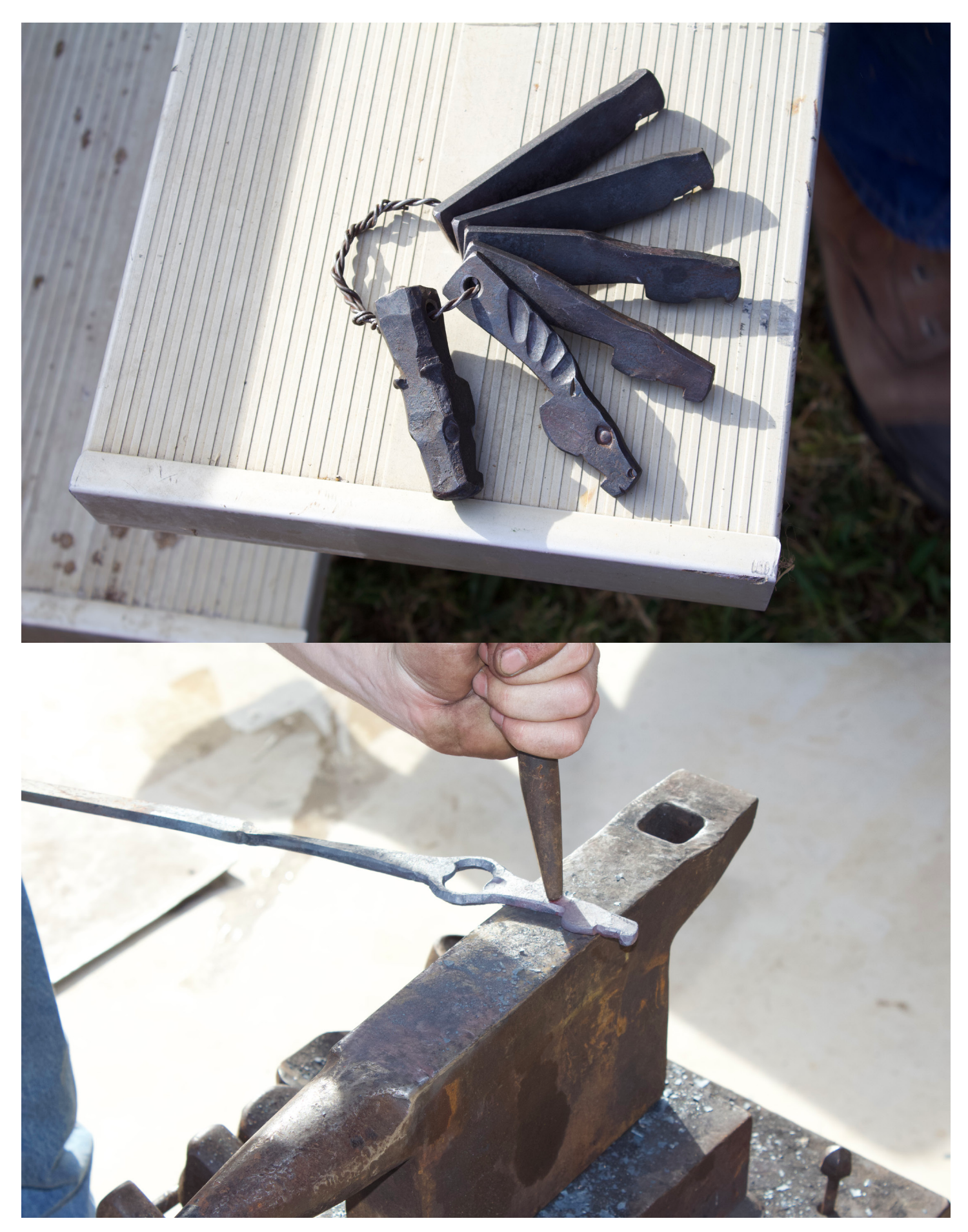
W W W . B A L C O N E S F O R G E . ORG