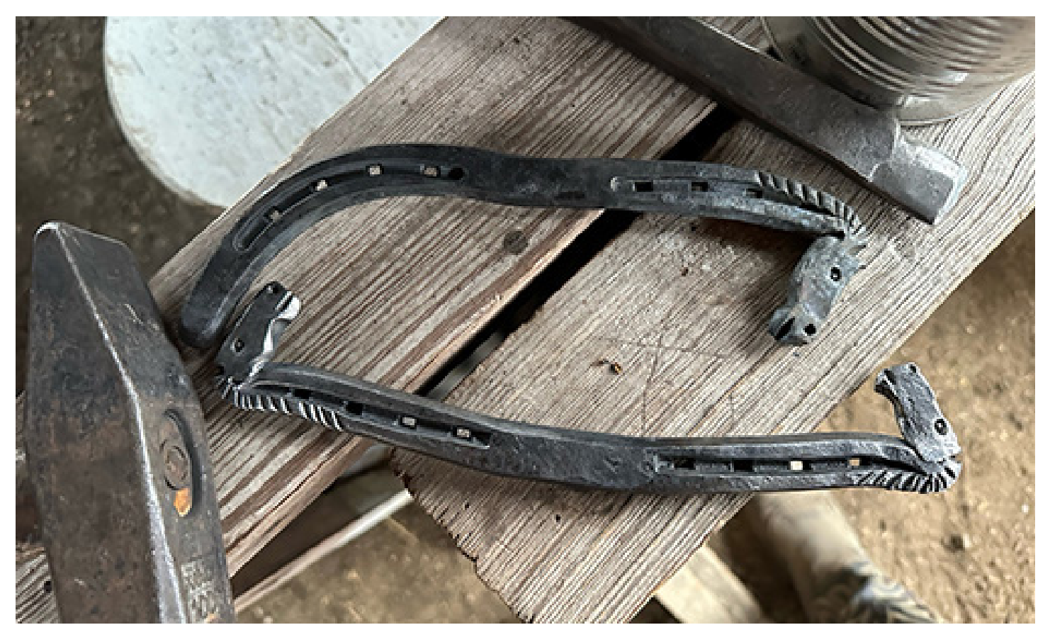
Demo pieces and trade items from February Meeting.