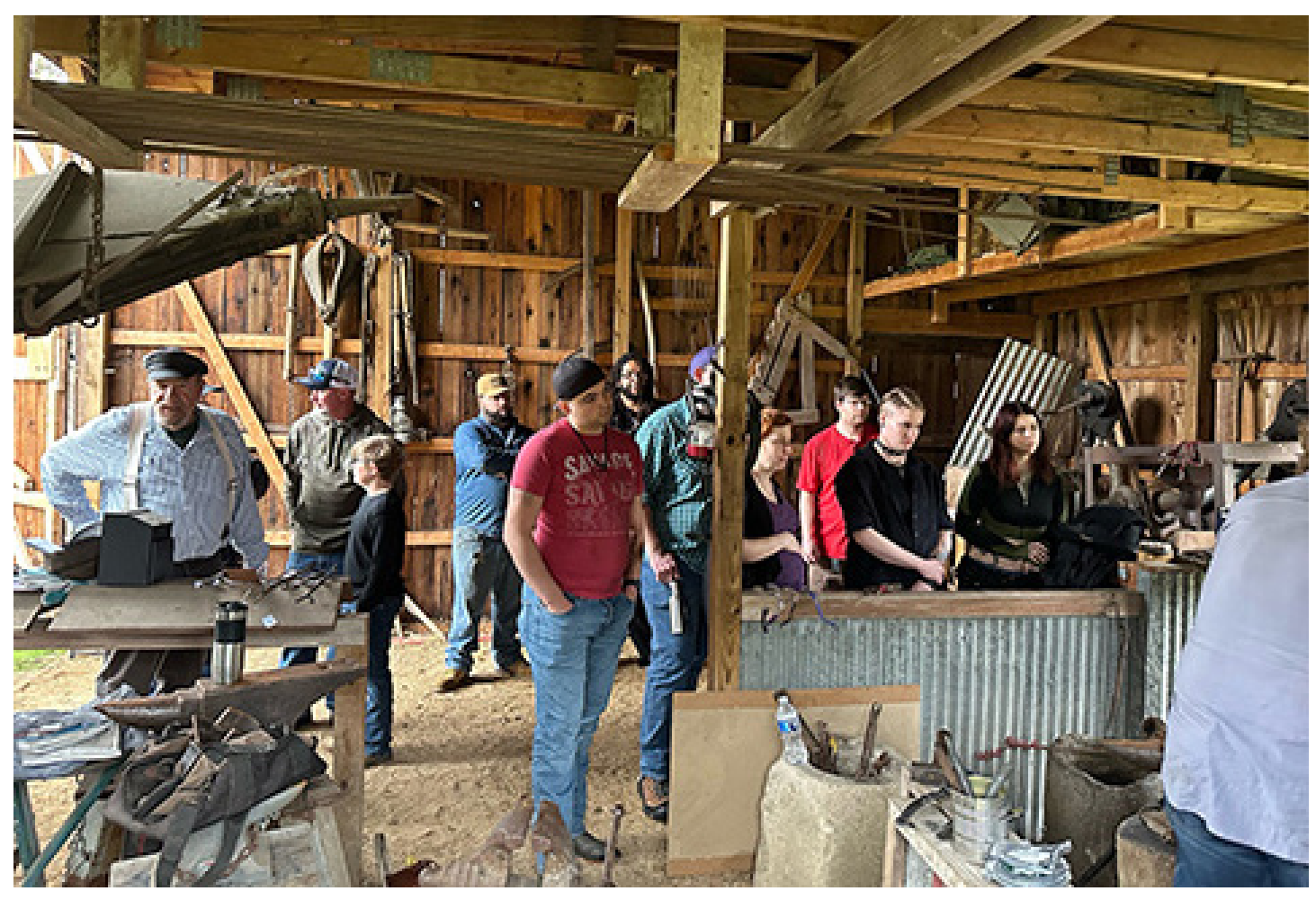
W W W . B A L C O N E S F O R G E . ORG