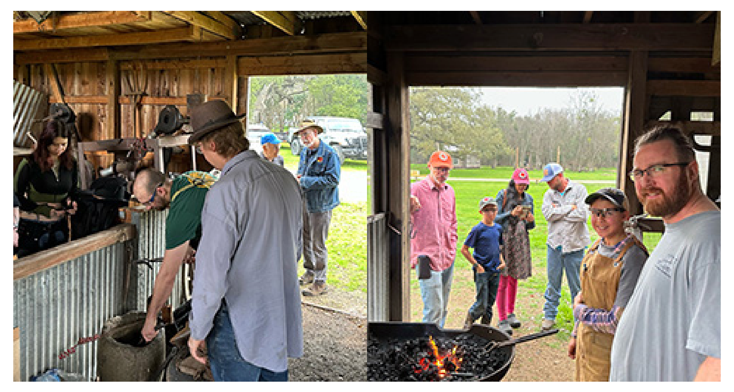
Lots of folks enjoying the demonstrations at the February meeting.