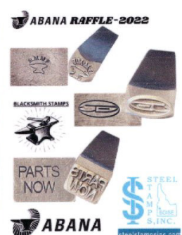
PRIZES 9, 10, & 11 (3 draws) Personal Touchmark Stamp Steel Stamps.