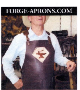
EIGHTH PRIZE Custom Forge Apron -Forge-Aprons